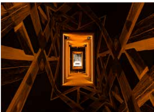
677 - Room 101 by Kerry Dutton