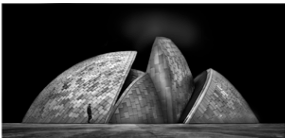
676 - Mosque by Kerry Dutton