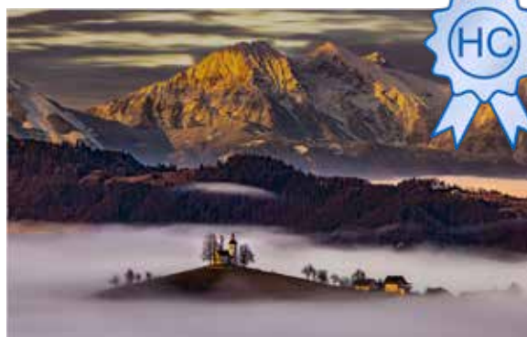
678 - Sunrise Above The Clouds - Slovenia by Alan West DPAGB BPE3*