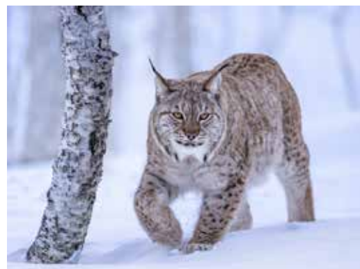
673 - Winter Lynx by Brian Howe