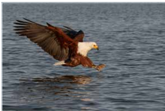
674 - African Fish Eagle by Steve Killoran