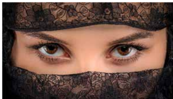
672 - Eye Contact by Andy Briggs