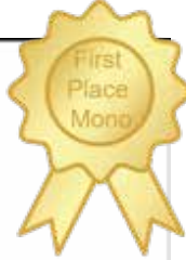
614 - Street Child by Anne Ruffelle