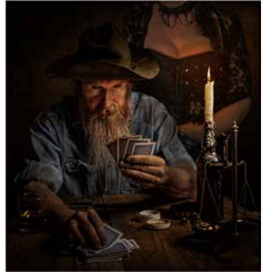
612 - Gold Digger by Ian Porter