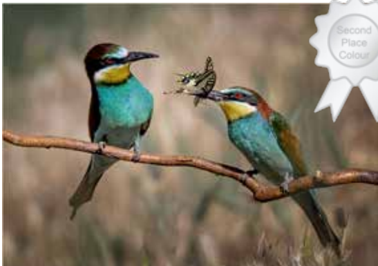
671 - Bee-eaters Food Passing by Alan West DPAGB BPE3*